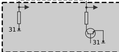
A2249 Digital diesel electronics control unit